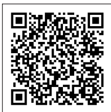
Inarin Official Channel Inarin官方频道

Lecturer: Teachers of Toyokawa Special Support School etc.